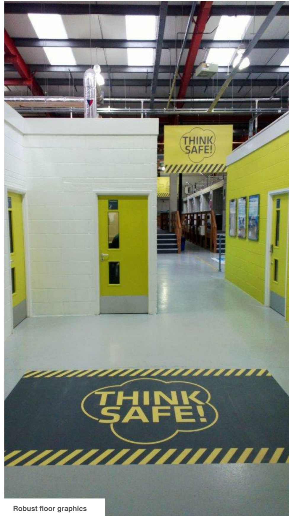
Robust floor graphics

There was minimal snagging which was carried out quickly. We understand from the feedback received that the client is very happy with the finished project.