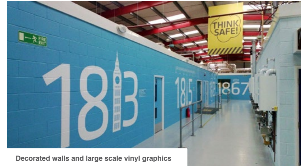
Decorated walls and large scale vinyl graphics