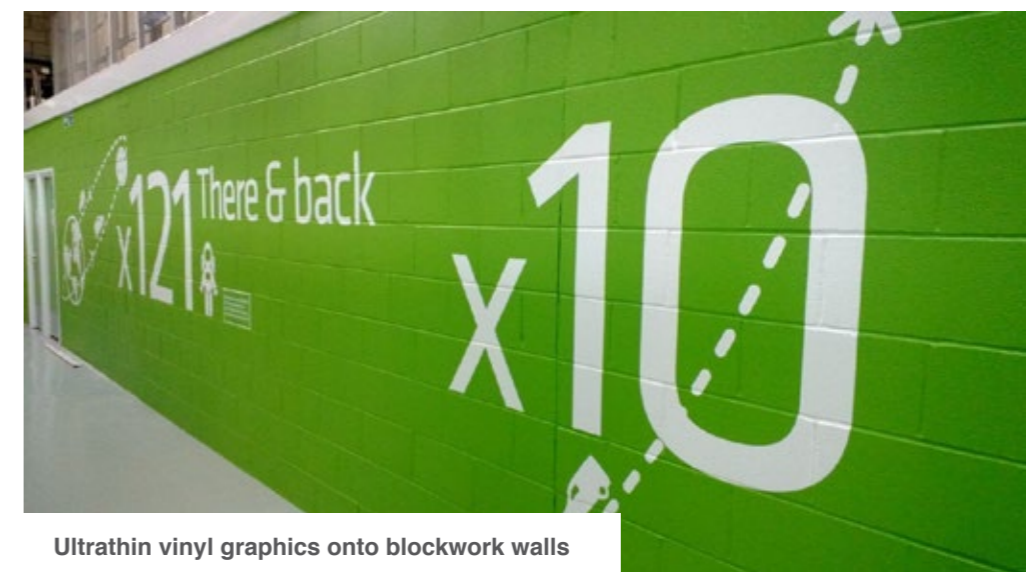
Ultrathin vinyl graphics onto blockwork walls